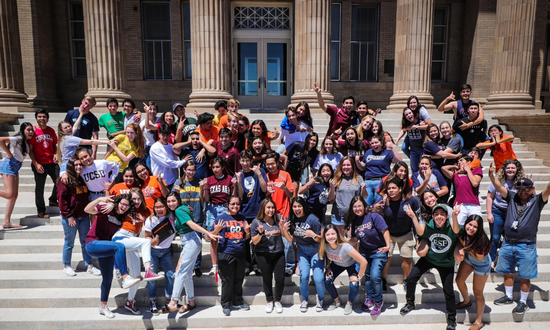
Class of 2019